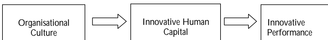
Figure 2: Conceptual Framework